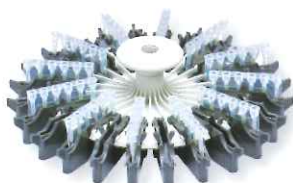
Head 24 ID-Cards